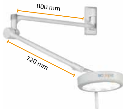
• Wall mounted