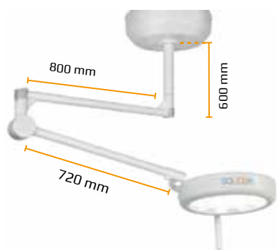
• Ceiling mounted (single or double configuration)

• SOLED15 is available in the following versions